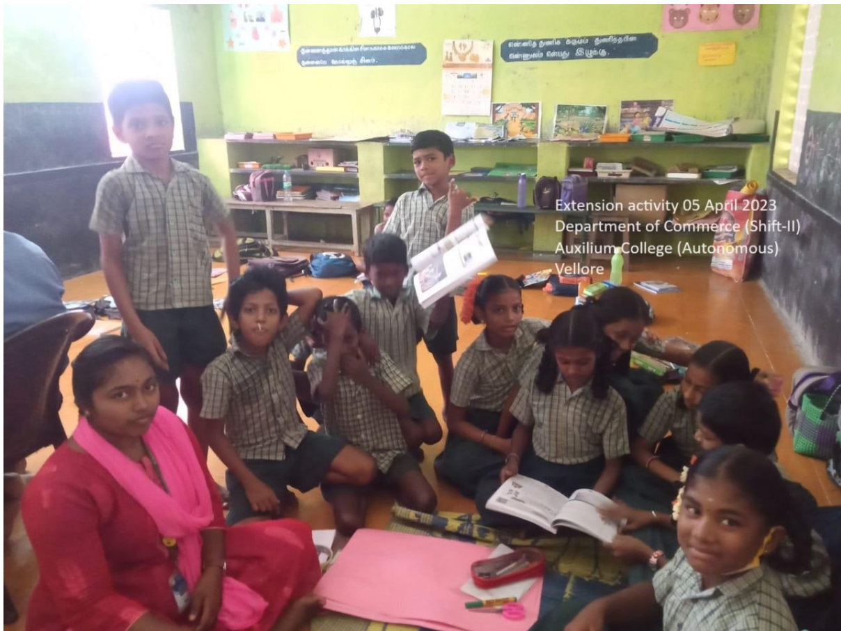
Extension activity 05 April 2023 Department of Commerce (Shift-II) Auxilium College (Autonomous) Vellore

Micro-teaching was done by all the three year students to nearly schools and government schools who could not get proper education and they are giving motivational classes for students.